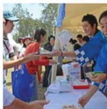
ビクトリア湖産の魚でつくられたケニア風カマボコとナイロビで行われた試食会